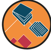
EMERGENCY NOTIFICATION SYSTEM