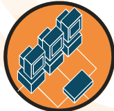
TECHNOLOGY MANAGEMENT AND SUPPORT TICKETING

The purchase of multiple modules will result in additional discounts. Additionally, the Survey Module is free with the purchase of any other module and the Notification Module is free with the purchase of any 2 modules.